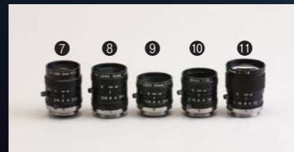
Wide / Narrow optic angle lens